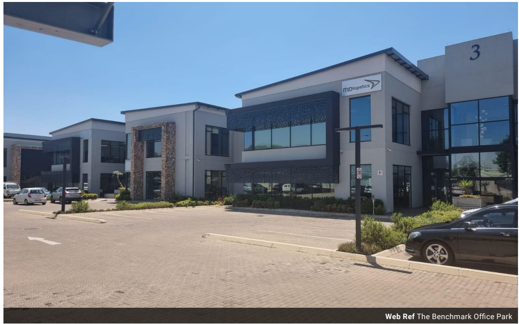
Web Ref The Benchmark Office Park

API House Ground floor 85 Wessel Road Rivonia