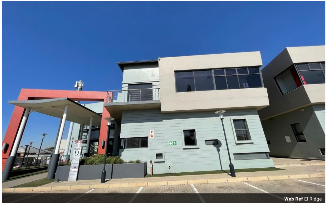
Web Ref El Ridge

API House Ground floor 85 Wessel Road Rivonia