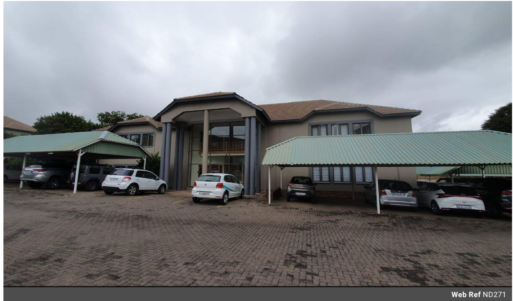
Web Ref ND271

Southdowns Office Park, Block D Ground Floor, Suite 6 & 7 22 Karree Street Irene Centurion