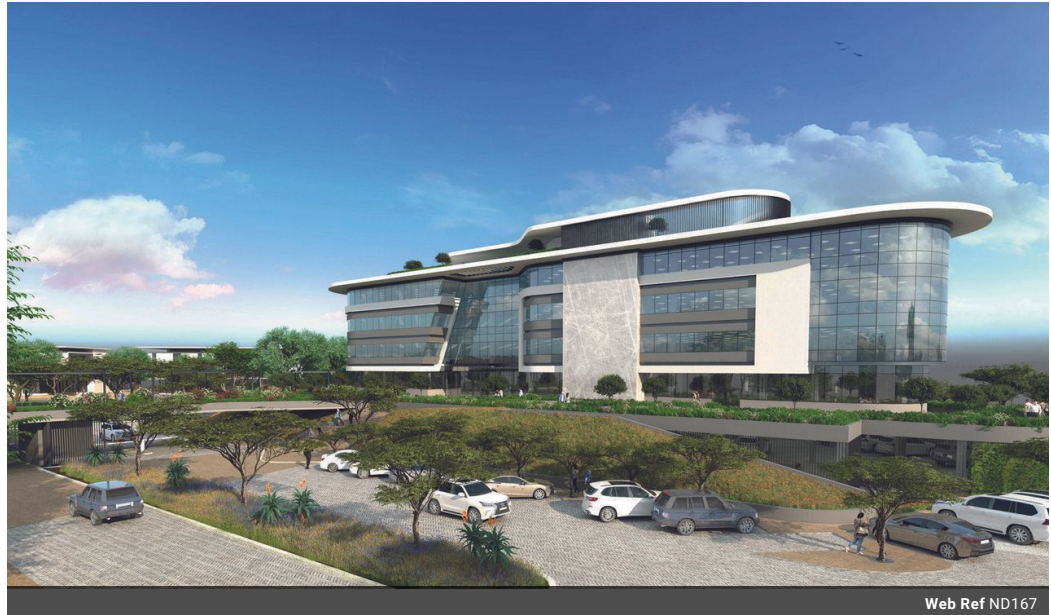
Web Ref ND167

Southdowns Office Park, Block D Ground Floor, Suite 6 & 7 22 Karree Street Irene Centurion