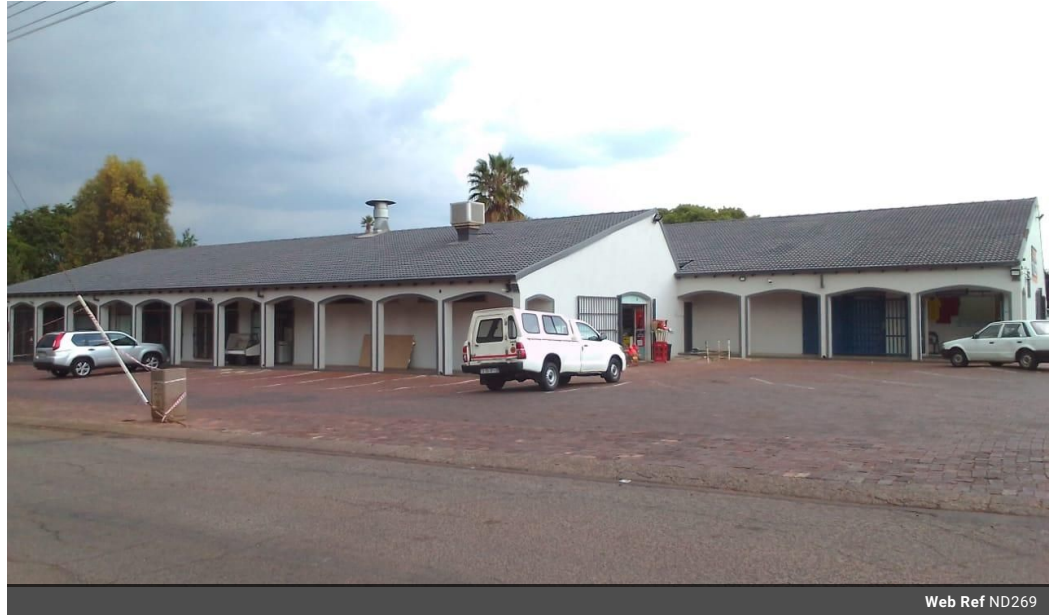
Web Ref ND269

Southdowns Office Park, Block D Ground Floor, Suite 6 & 7 22 Karree Street Irene Centurion