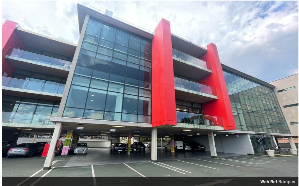
Web Ref Bompas

API House Ground floor 85 Wessel Road Rivonia