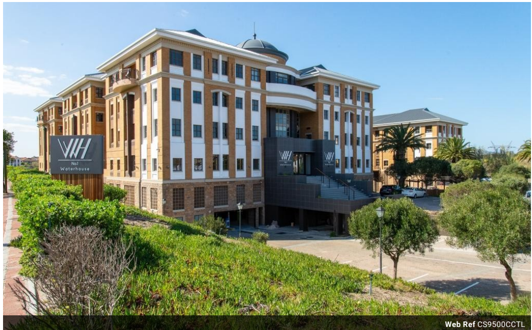
Web Ref CS9500CCTL

Block 4, Portion of 1st Floor Unit 403, De Tijger Office Park Cnr McIntyre & Hannes Louw Drive Parow