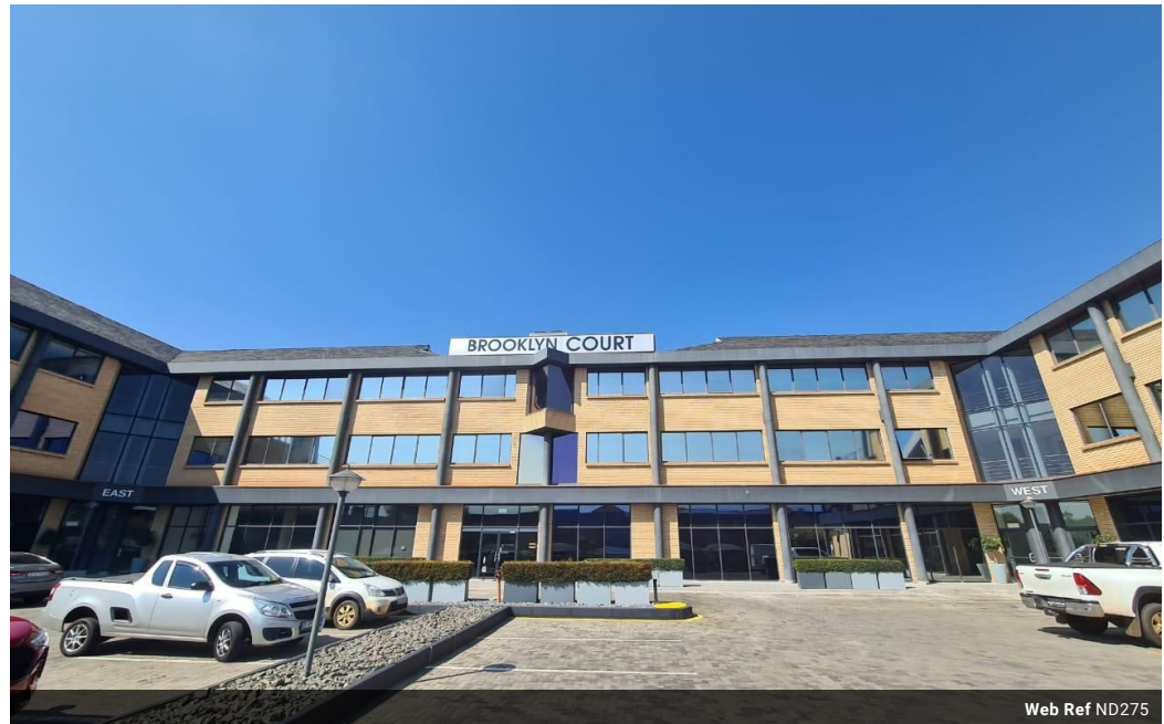
Web Ref ND275

Southdowns Office Park, Block D Ground Floor, Suite 6 & 7 22 Karree Street Irene Centurion