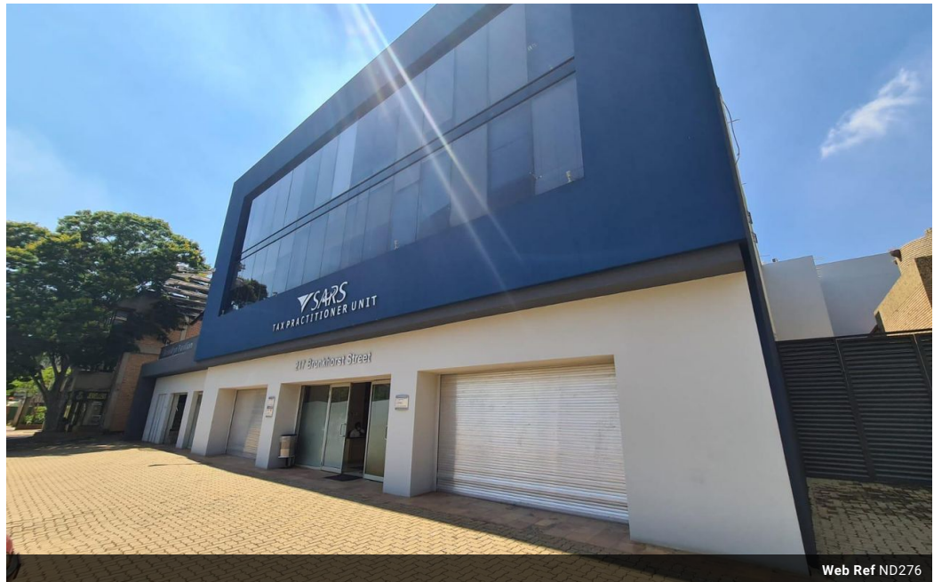
Web Ref ND276

Southdowns Office Park, Block D Ground Floor, Suite 6 & 7 22 Karree Street Irene Centurion