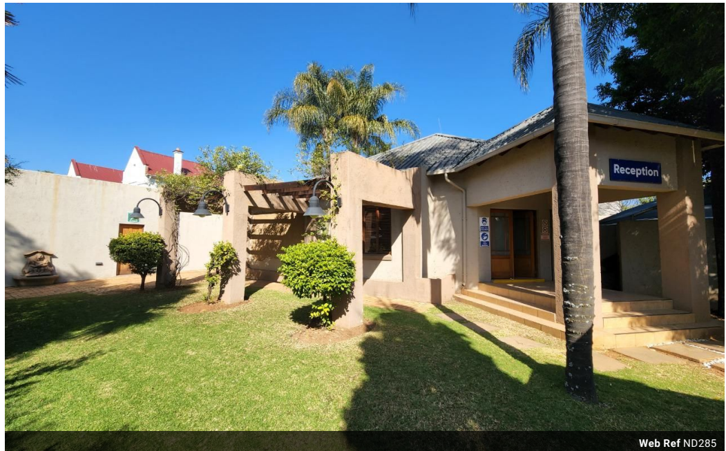
Web Ref ND285

Southdowns Office Park, Block D Ground Floor, Suite 6 & 7 22 Karree Street Irene Centurion