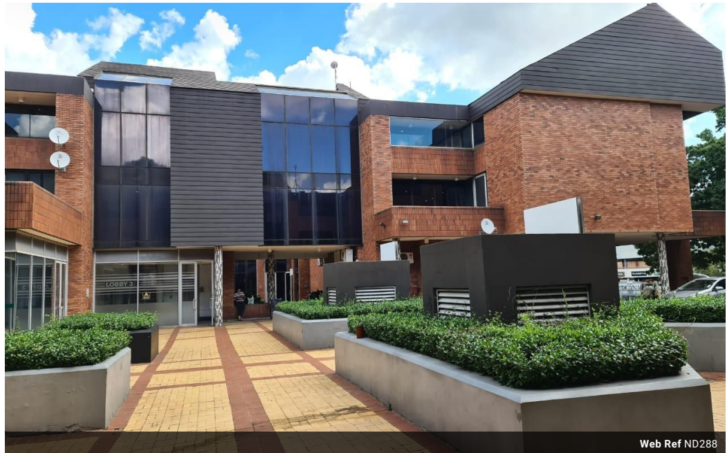
Web Ref ND288

Southdowns Office Park, Block D Ground Floor, Suite 6 & 7 22 Karree Street Irene Centurion