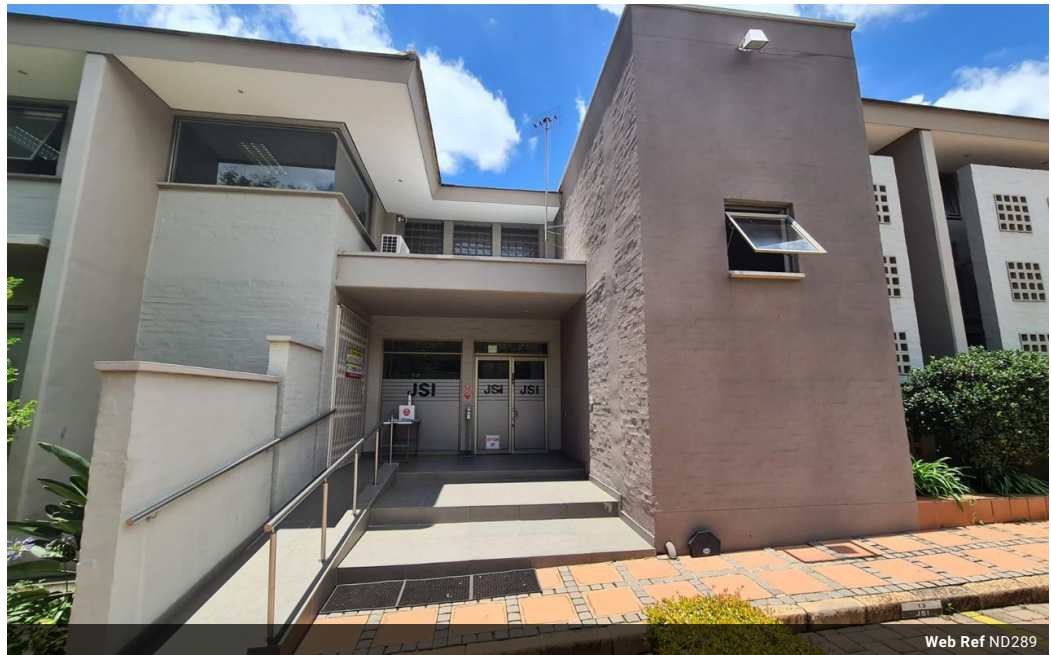
Web Ref ND289

Southdowns Office Park, Block D Ground Floor, Suite 6 & 7 22 Karree Street Irene Centurion