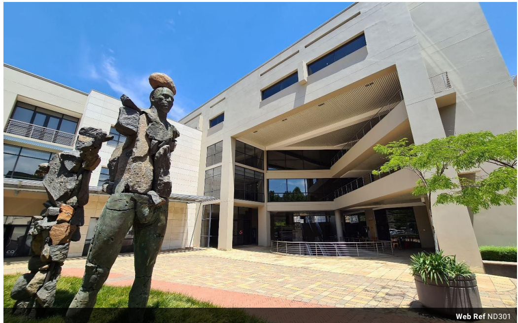
Web Ref ND301

Southdowns Office Park, Block D Ground Floor, Suite 6 & 7 22 Karree Street Irene Centurion