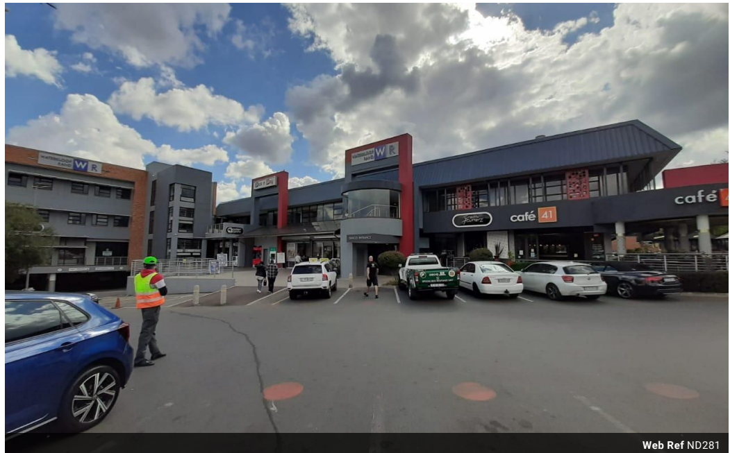
Web Ref ND281

Southdowns Office Park, Block D Ground Floor, Suite 6 & 7 22 Karree Street Irene Centurion