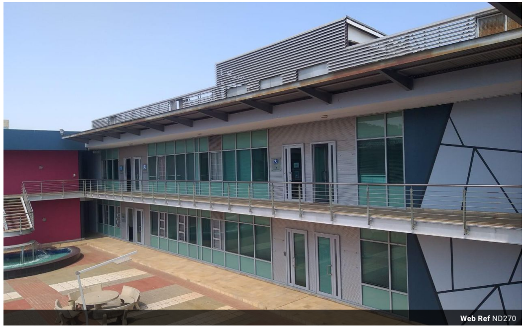
Web Ref ND270

Southdowns Office Park, Block D Ground Floor, Suite 6 & 7 22 Karree Street Irene Centurion