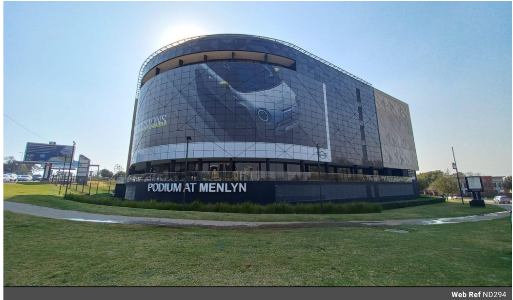
Web Ref ND294

Southdowns Office Park, Block D Ground Floor, Suite 6 & 7 22 Karree Street Irene Centurion