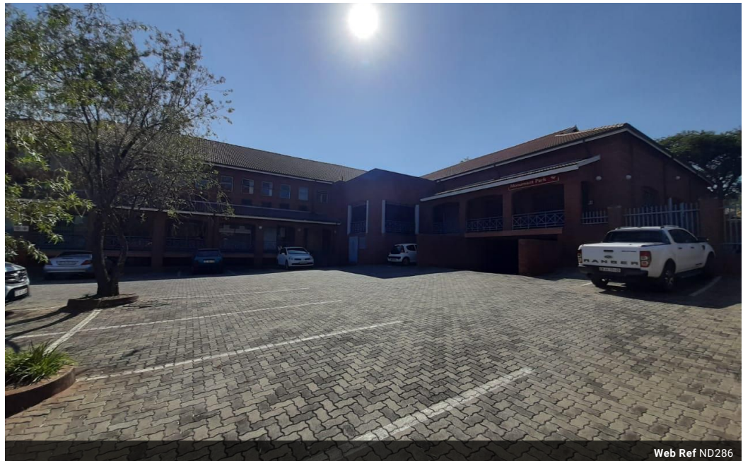
Web Ref ND286

Southdowns Office Park, Block D Ground Floor, Suite 6 & 7 22 Karree Street Irene Centurion