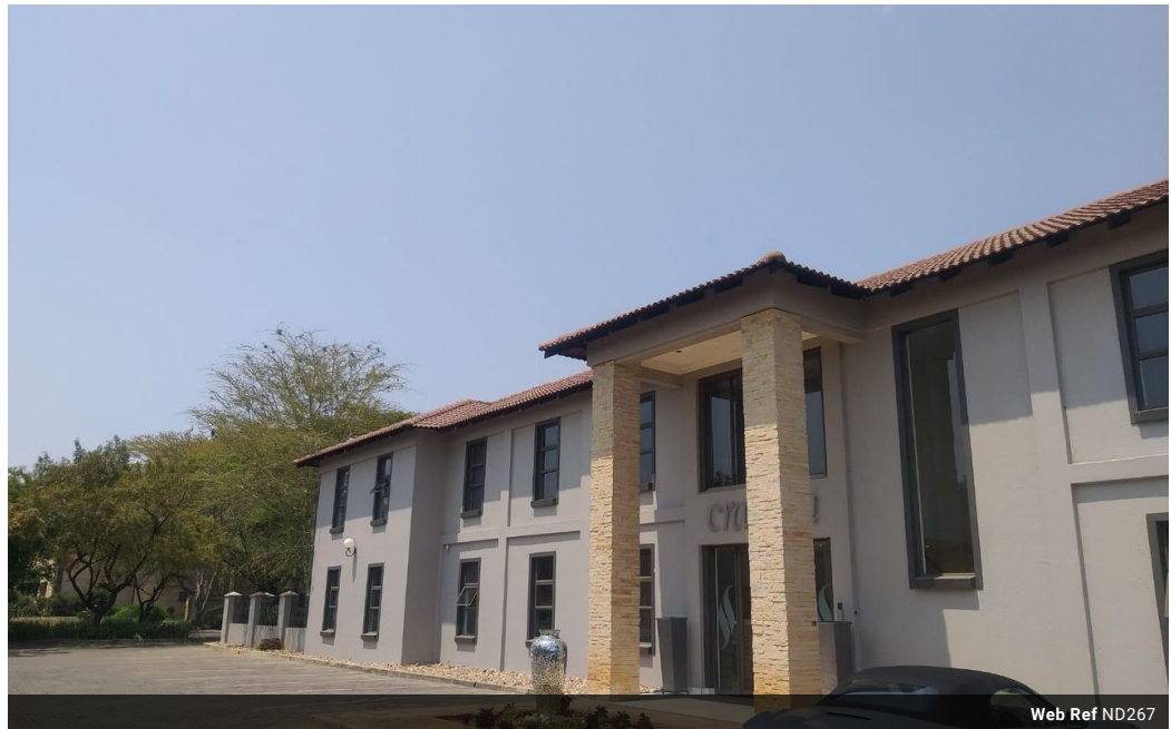
Web Ref ND267

Southdowns Office Park, Block D Ground Floor, Suite 6 & 7 22 Karree Street Irene Centurion