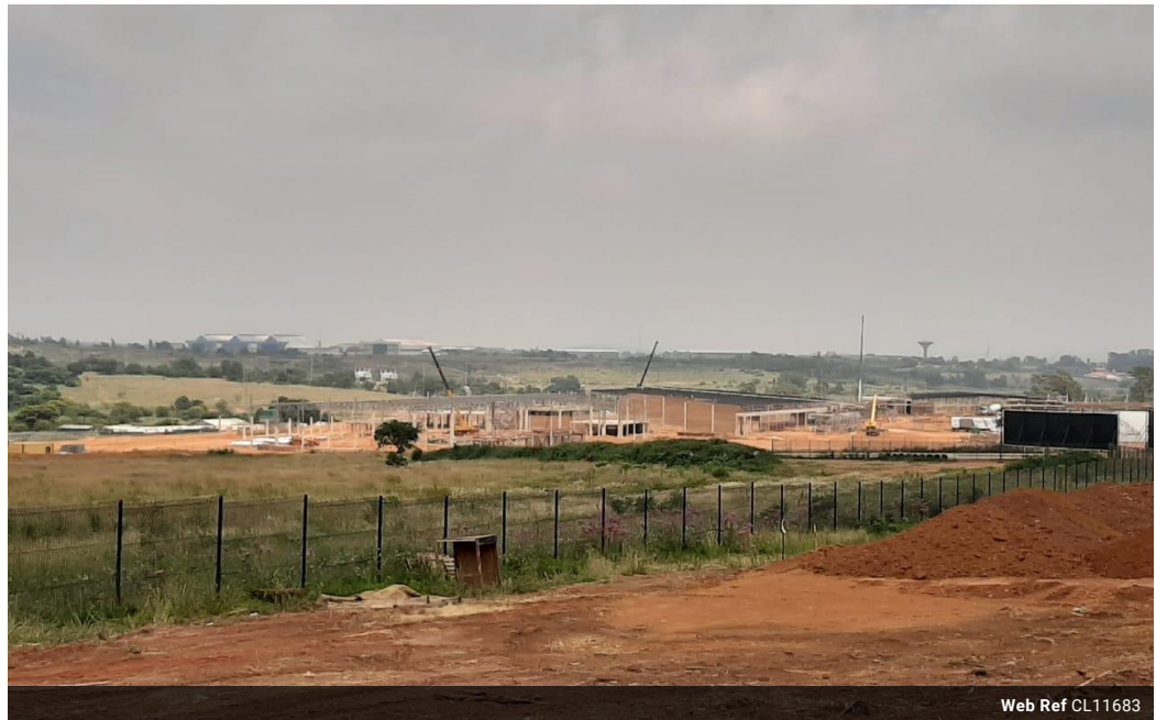
Web Ref CL11683

Southdowns Office Park, Block D Ground Floor, Suite 6 & 7 22 Karree Street Irene Centurion