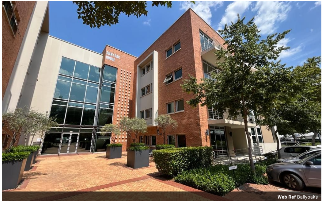
Web Ref Ballyoaks

API House Ground floor 85 Wessel Road Rivonia