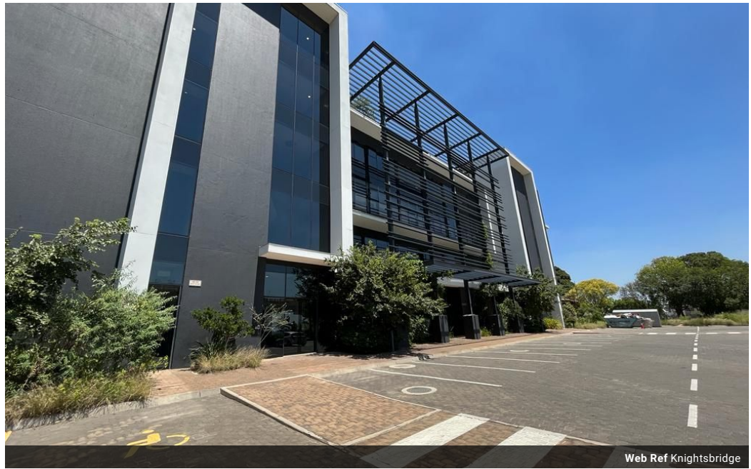
Web Ref Knightsbridge

API House Ground floor 85 Wessel Road Rivonia