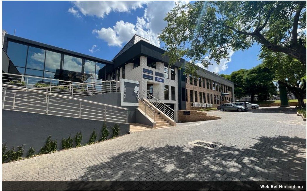
Web Ref Hurlingham

API House Ground floor 85 Wessel Road Rivonia