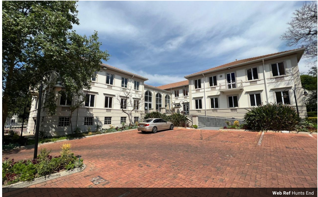
Web Ref Hunts End

API House Ground floor 85 Wessel Road Rivonia